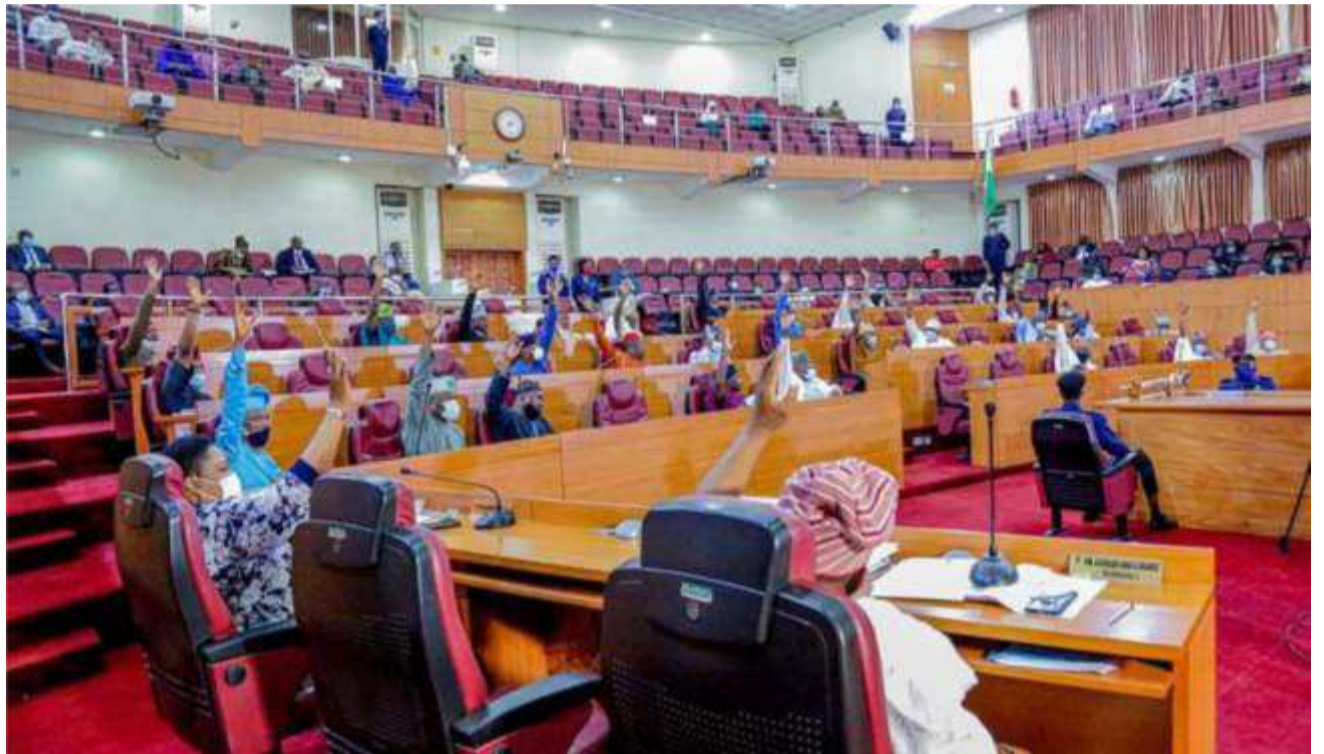
Lagos House of Assembly